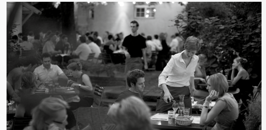
AN OUTDOOR RESTAURANT IN THE CENTRE OF ZÜRICH'S HISTORIC QUARTERS: It's an insider's tip.

Now, if first and foremost hearty, owner-chef cooked down-home Swiss food