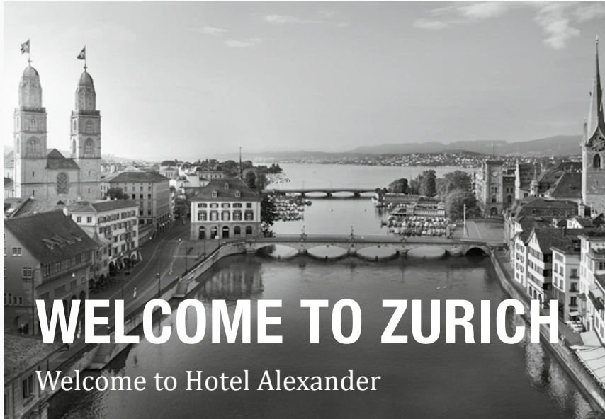
STROLLING ALONG THE LIMMATQUAI IN ZURICH: A big array of restaurants and cafés await and welcome you.