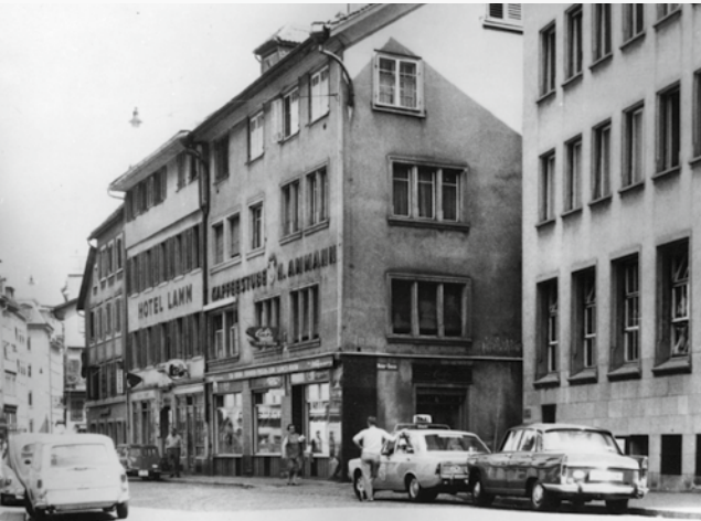
The next door houses, Mutzhas and Sodom before their modification to become Hotel Alexander in 1971.

*Up to now, business people, craftsmen and self-employed persons of one and the same trade meet to pursue the conservation of tradition and the fosterage of festive events. The main highlight of public appearance of the guilds is the yearly event, called Sechselaeuten. Guild members parade the streets in their traditional costumes rejoicing onlookers with a reminiscence of their glorious history. The event normally takes place every third Monday in April. If that day happens to in the Holy Week or Easter Monday the event will take place a week later.